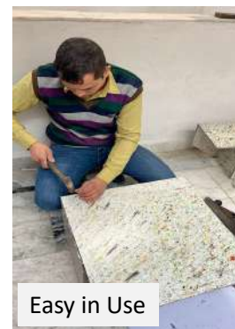
Easy in Use